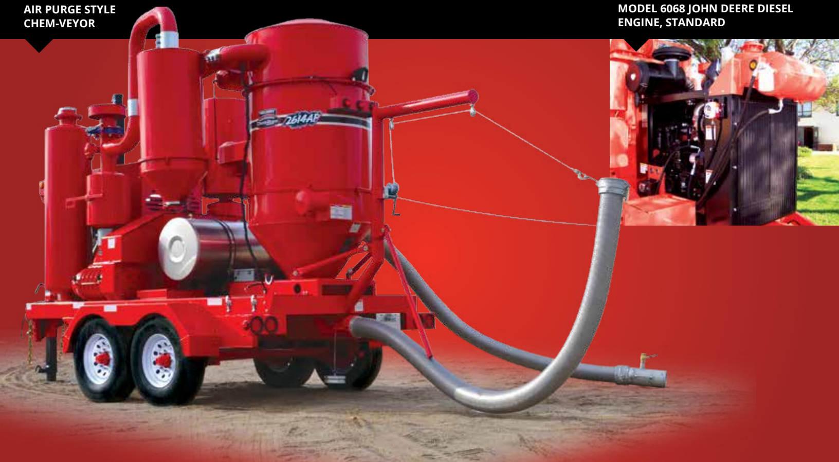
MODEL 6068 JOHN DEERE DIESEL ENGINE, STANDARD