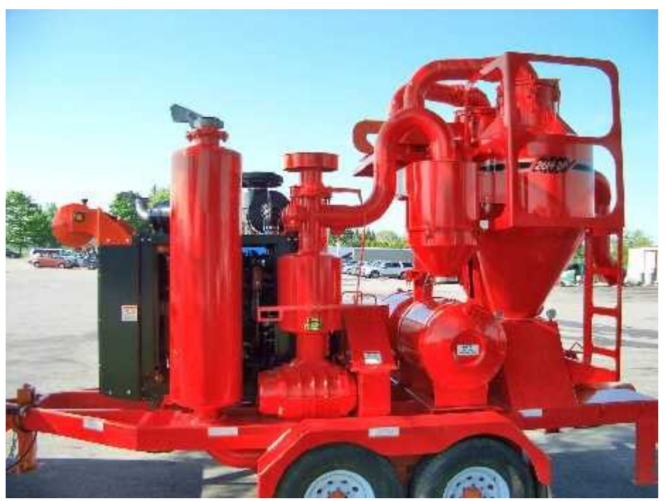
Fig. 1 SAFETY DECALS