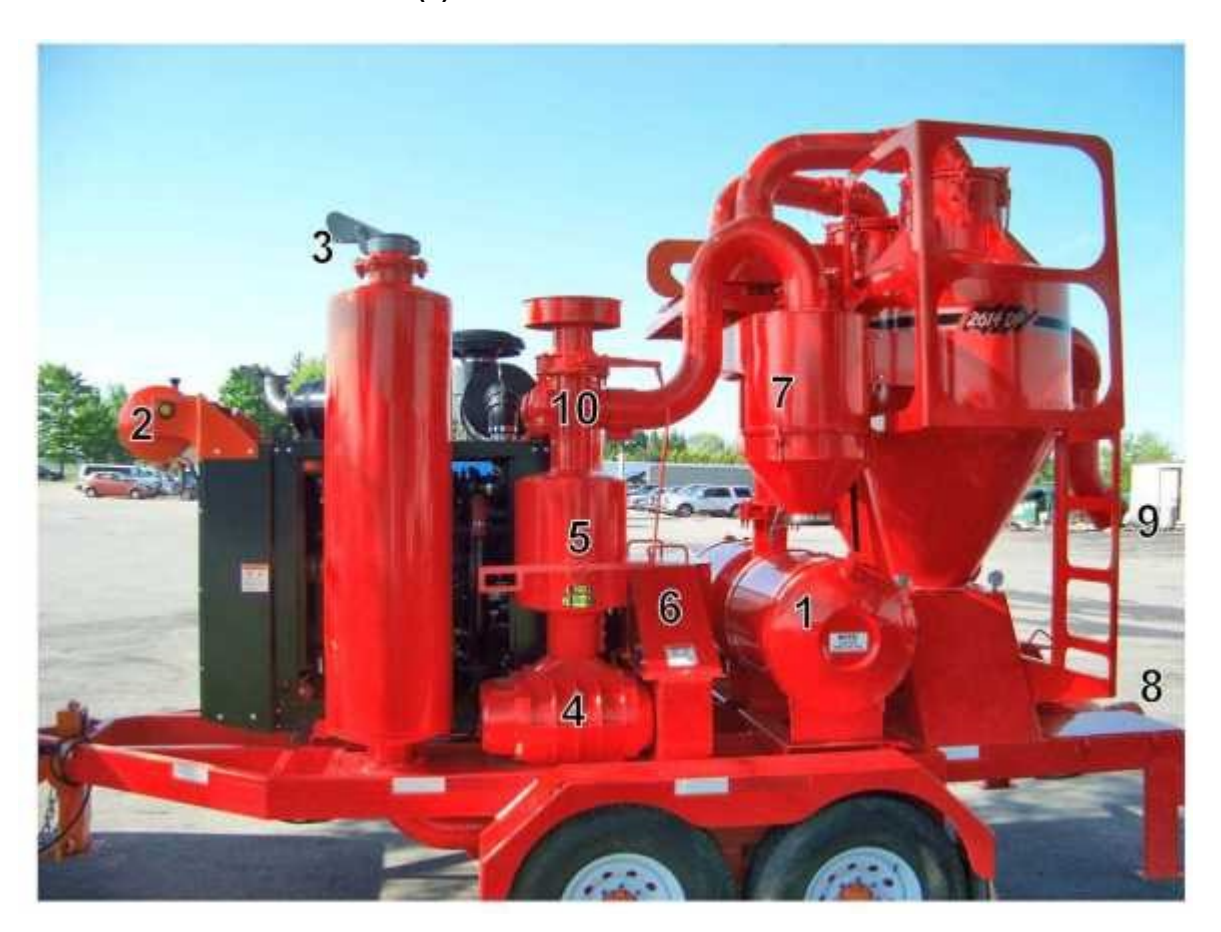
Fig. 4 MACHINE COMPONENTS