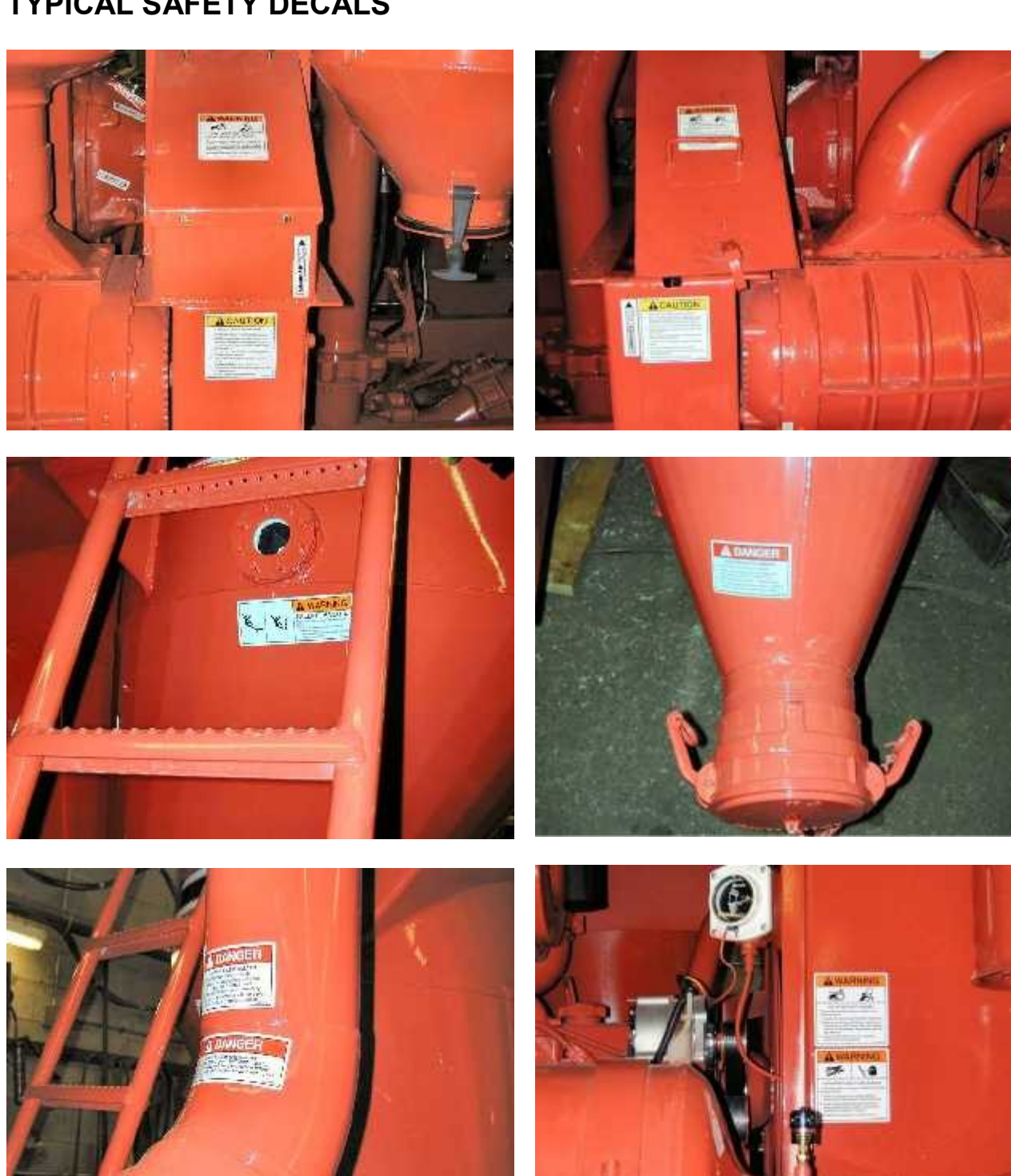
Fig. 3 TYPICAL SAFETY DECALS

REMEMBER - If safety signs have been damaged, removed, become illegible or parts are replaced without signs, new signs must be applied. New signs are available from your authorized dealer or factory direct.