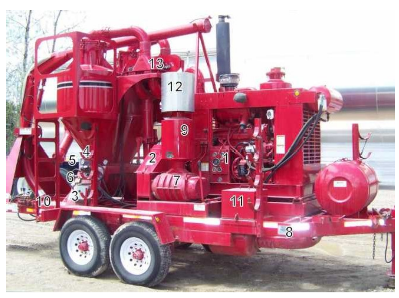
Fig. 5 MACHINE COMPONENTS