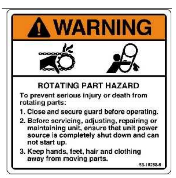
Fig. 2 TYPICAL SAFETY DECAL LOCATIONS