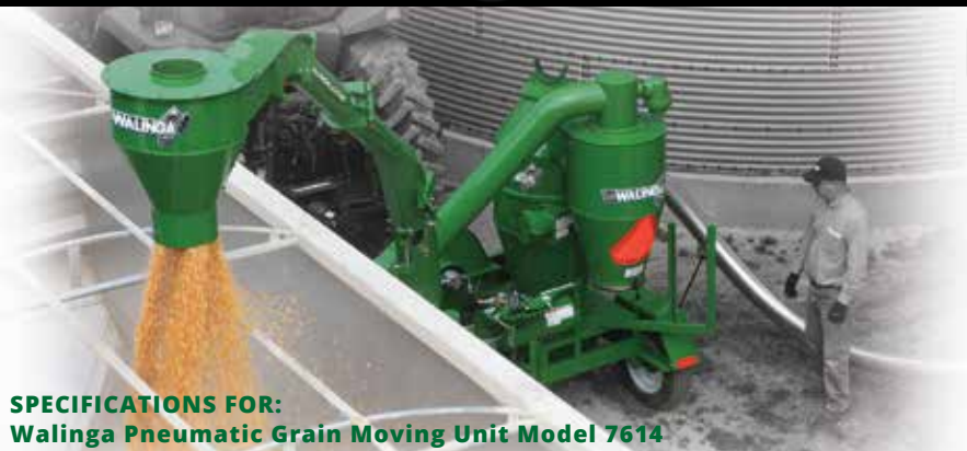
SPECIFICATIONS FOR: Walinga Pneumatic Grain Moving Unit Model 7614