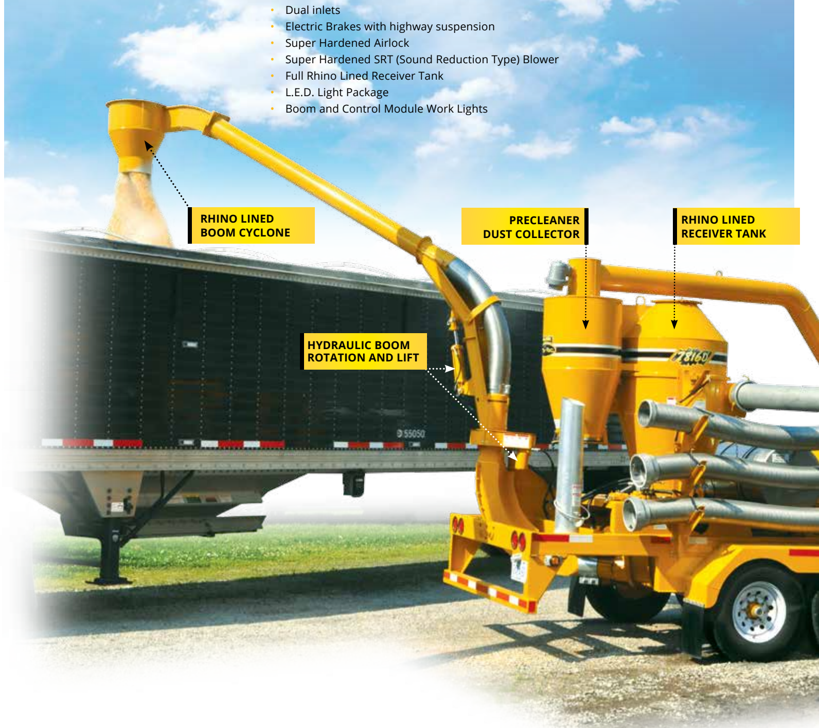
RHINO LINED BOOM CYCLONE