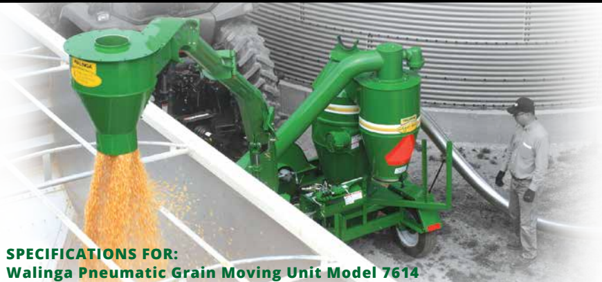
SPECIFICATIONS FOR: Walinga Pneumatic Grain Moving Unit Model 7614